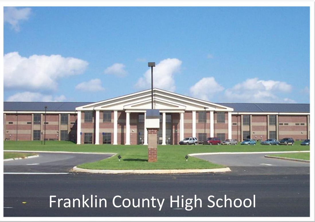
Franklin County H igh School