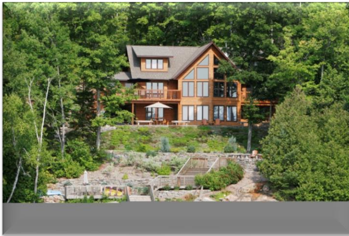
Luxurious Lake Homes