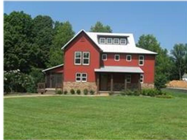
Family Homes with Acreage